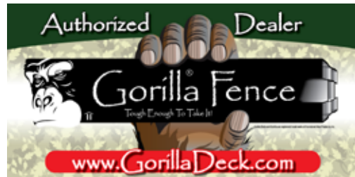
2' x 4' GORILLA FENCE BANNER FSAM-001-06

Large 2' x 4' Gorilla Matrix/Column/Post Banner. $22.00 - Sold individually.