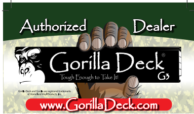
5.5" x 3.25" GORILLA DECK DECAL FSAM-002-01