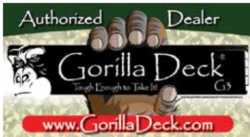
2' x 4' GORILLA DECK BANNER FSAM-001-01

Large 2' x 4' Gorilla Deck Banner. $22.00 - Sold individually.