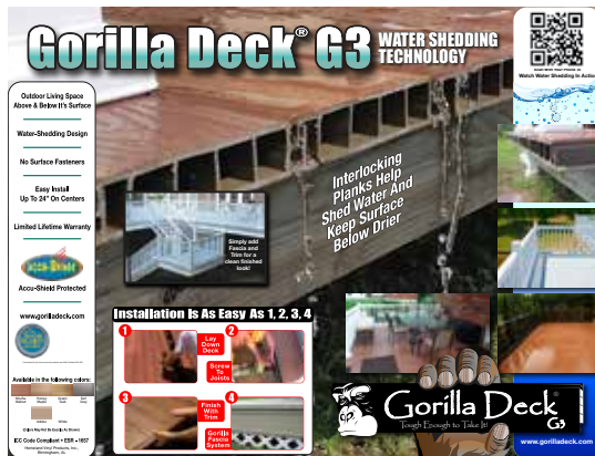
21" x 16" GORILLA DECK COUNTER MAT