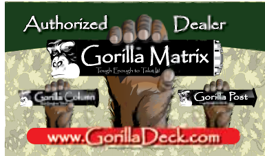
5.5" x 3.25" GORILLA MATRIX DECAL FSAM-002-03