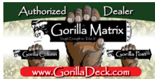
2' x 4' GORILLA MATRIX/COLUMN/POST BANNER FSAM-001-03

Large 2' x 4' Gorilla Deck Banner. $22.00 - Sold individually.