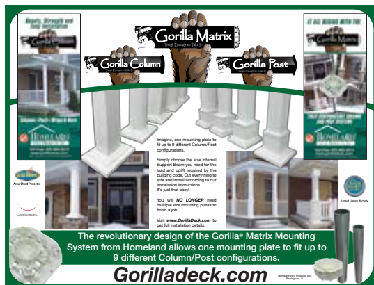
21" x 16" GORILLA MATRIX/COLUMN/POST COUNTER MAT