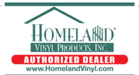
2' x 4' HOMELAND VINYL BANNER FSAM-001-04

Large 2' x 4' Gorilla Fence Banner. $22.00 - Sold individually.